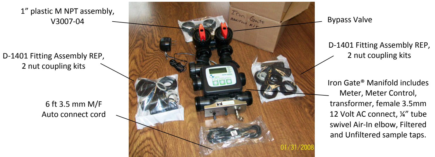
Figure 1 – Parts List

Remove components of Iron Gate® Manifold Kit and assemble as pictured in Figure 2. Figure 1 shows all manifold kit pieces.