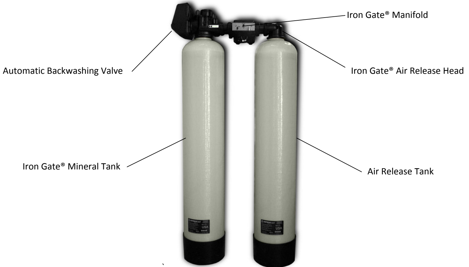
Figure 4 – Iron Gate Filter Assembly