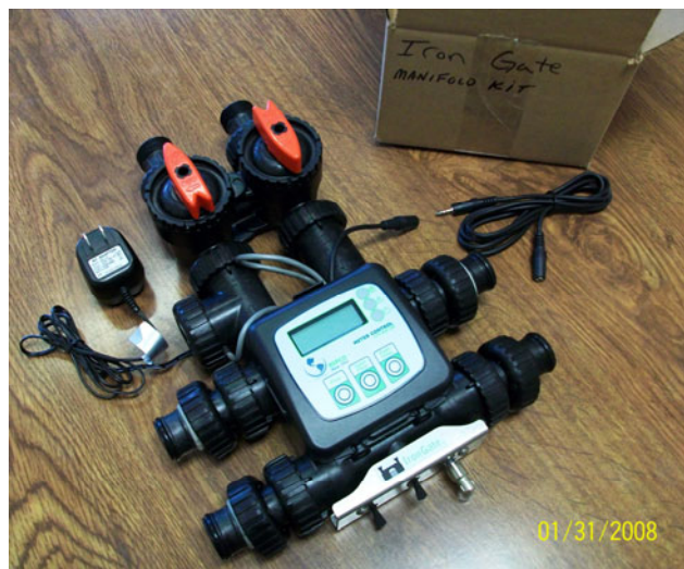
Figure 2 – Assembly